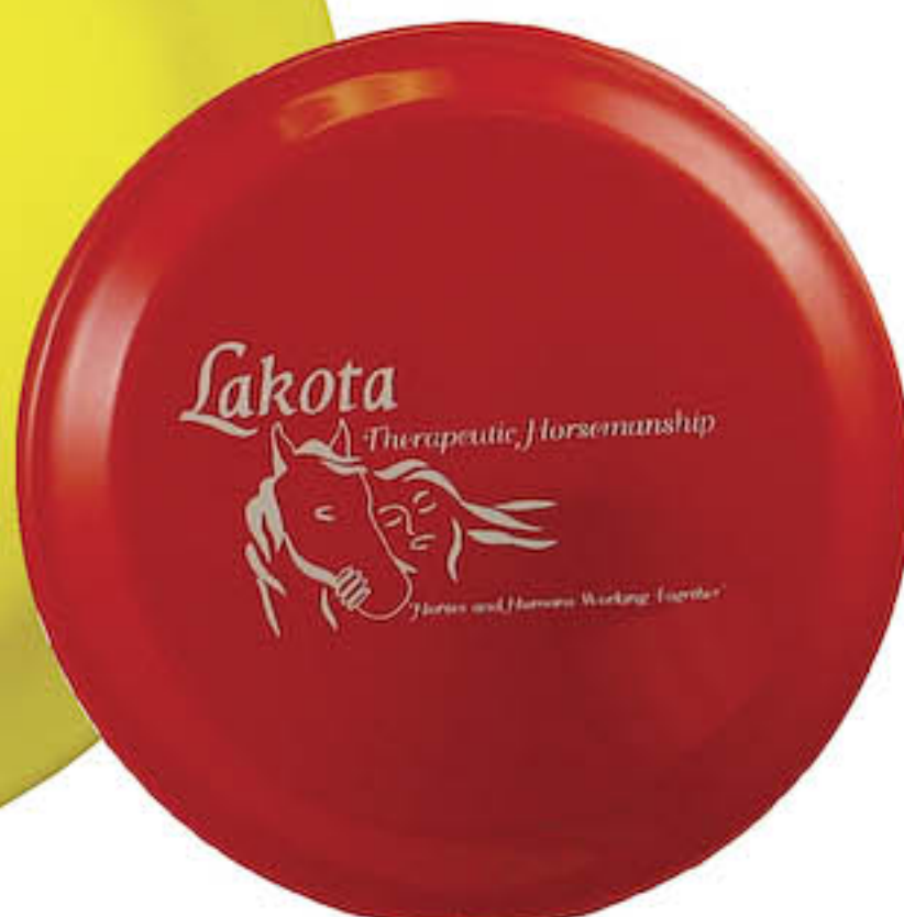
#ZZFJR 5" DIAMETER JR. ZEBRA ZIP FLYER