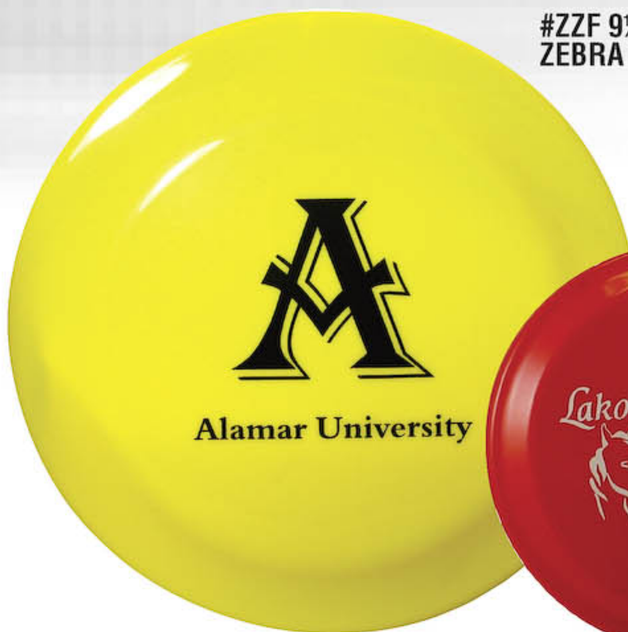
#ZZF 9½" DIAMETER ZEBRA ZIP FLYER